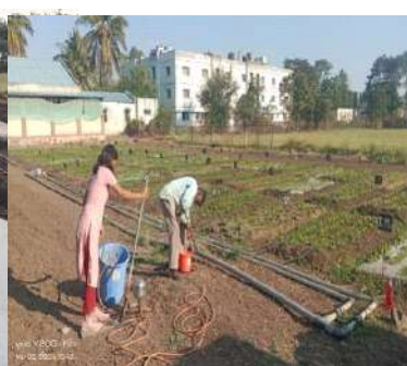
Fig 4: Represents the Fertilizer application in the field trials