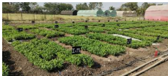
Fig 2 : Represents the on crop growth with 100% wool mulch, micronutrient coated mulch and synthetic mulch.