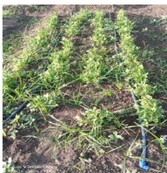
Mo: Control-no mulch