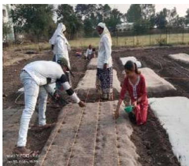
Fig 3: Represents the sowing of seeds in the field trials