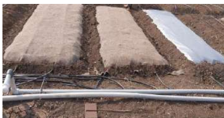
Fig 1 : Represents the on field layering of 100% wool mulch, micronutrient coated mulch and synthetic mulch.