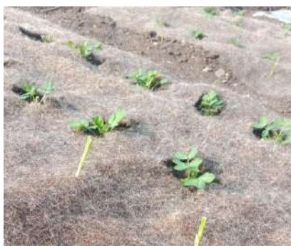
M1: Biodegradable (100 % wool)