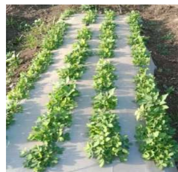
M4: Silver-Black Plastic mulch