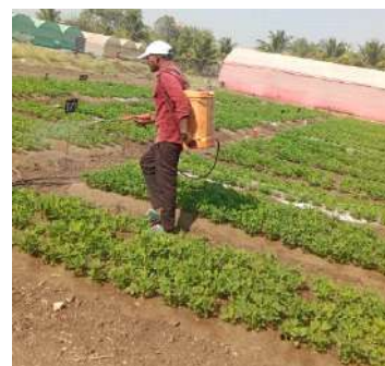
Fig 5 : Represents the insecticide spraying